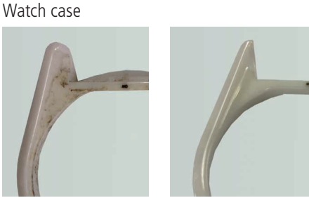
Removal of polishing pastes