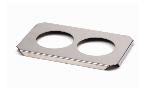
Perforated cover for using beakers