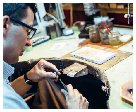
Cleaning of rings, necklaces, earrings, etc.