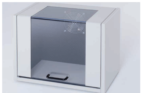
Noise protection box